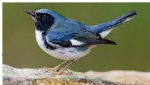
Black Throated Blue Warbler found right in Central Park!

The best Christmas present we could have is HOPE for our beautiful Earth that God has given to us with all its glory. Let's all work together Saint Francis!