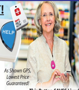
This Button SAVES Lives!